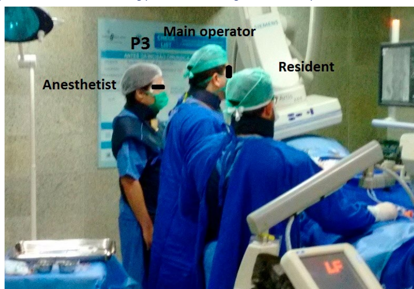
Figure 3. Anesthetist standing position on the right side of the patient.