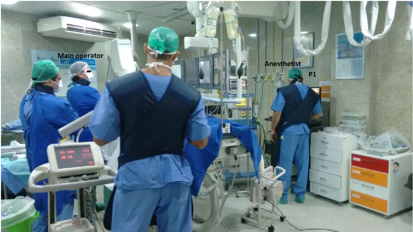
Figure 1. Relatively safe position of the anesthetist within the X-ray room.