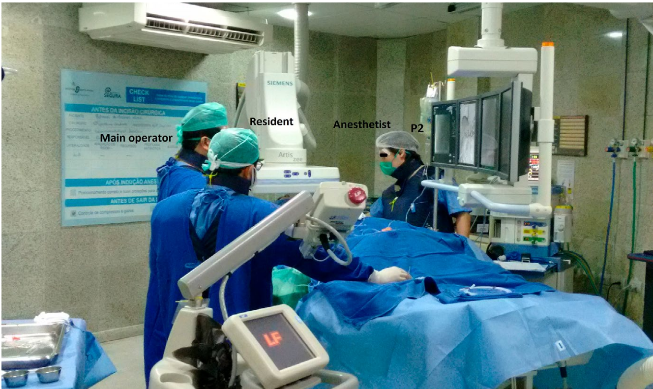
Figure 2. Anesthetist monitoring patient hemodynamic function during HC procedure.