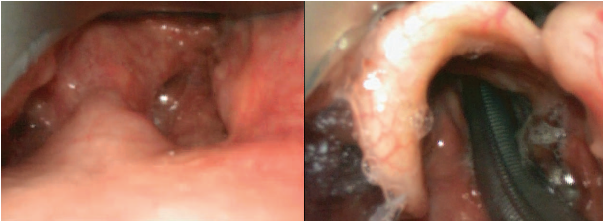
Figure 2. Rescue with D-Blade videolaryngoscopy in patients with de Morquio syndrome.

ethical standards of the responsible human experimentation committee, and the World Medical Association and the Declaration of Helsinki.