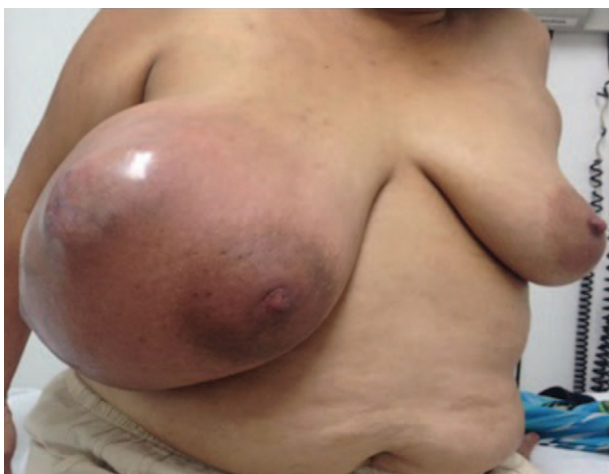
Figure 1. Breast mass pre-operatively.