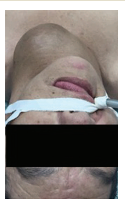
Figure 2. Neck mass.

neck, associated with dysphagia and dysphonia. The electrocardiogram was normal, prior functional class I/IV, whole blood time, coagulation times and electrolytes were also normal, with the only finding being a slightly lower albumin value.