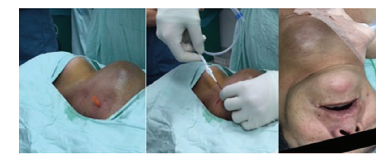
Figure 4. Percutaneous cannulation of the trachea.

#7.5 cannula was introduced (Fig. 4), confirming correct placement by means of capnography.