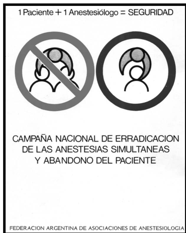
Fig. 2 – National Campaign Against Simultaneous Anaesthesia. Mendoza Association of Anaesthesiology, 1987.

(personal communication) there are close to 1400 anaesthetists and 11.14 million inhabitants (1 anaesthetist for every 8000 people), and in Havanah, the capital city, there are 420 anaesthetists to serve 2 million inhabitants (1 for every 4761 inhabitants). In Argentina, according to Weissbrod EP, member and secretary of the Argentinian Society of Anaesthesia, Analgesia and Resuscitation of Buenos Aires (AAARBA) (personal communication) there are 12.8 million inhabitants and 2018 anaesthetists (1 for every 6343 inhabitants). In Managua, capital city of Nicaragua, according to Arguello B, member of the Anaesthesia Society of Nicaragua (personal communication), the situation is complex given that there are approximately 1.6 million inhabitants and only 100 anaesthetists (1 for every 16,000 inhabitants). The thinking, therefore, may be that the number of anaesthetists is insufficient, creating the need to practice simultaneous anaesthesia in certain places. However, according to some experts, the reality does not always coincide with the figures, 16 and when the operating rooms are licensed