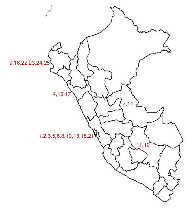
Fig. 1 - Locations of the hospitals that participated in the study. Guillermo Almenara Irigoyen National Hospital, 1 Edgardo Rebagliati Martins National Hospital,<sup>2</sup> Ate-Vitarte Emergencies Hospital,<sup>3</sup> Belén de Trujillo Hospital,<sup>4</sup> Daniel Alcides Carrion National Hospital, <sup>5</sup> Sergio E. Bernales Hospital (Collique),6 Level II Pucallpa-Essalud Hospital,7 Dos de Mayo National Hospital,8 Santa Rosa-Piura Level I Support Hospital, 9 Hipólito Unanue National Hospital, 10 Adolfo Guevara Velasco-Essalud National Hospital, Cusco, 11 Cusco Regional Hospital, 12 Madre Niño San Bartolome National Teaching Hospital, 13 Yarinacocha Amazon Hospital,<sup>14</sup> Trujillo Regional Teaching Hospital,<sup>15</sup> José Cayetano Heredia-Regional Hospital, Piura, 16 Víctor Lazarte Echegaray National Hospital, Trujillo, 17 Arzobispo Loayza National Hospital, 18 Central Police Hospital, 19 Hospital Regional Lambayeque-Chiclayo Regional Hospital,<sup>20</sup> Alberto Sabogal Sologuren National Hospital,<sup>21</sup> HAMO,<sup>22</sup> HEJCU,<sup>23</sup> Coronel Luis Arias Schreiber Central Military Hospital,<sup>24</sup> Sullana Level II Support Hospital.<sup>25</sup>

All the interviewers were instructed on the correct administration of the questionnaire and were given the response sheets for common questions to the interviewees. After the surveys were given, the data were entered in an Excel database