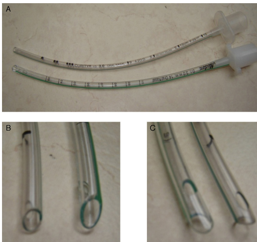
Fig. 2 – (A) Two classes of endotracheal tubes with the same internal diameter, (B) different external diameter, and (C) different tip designs.

In conclusion, although there are situations where cuffed tubes are better than uncuffed tubes, both can cause injury to the patient. Short-term intubation, adequate diameter