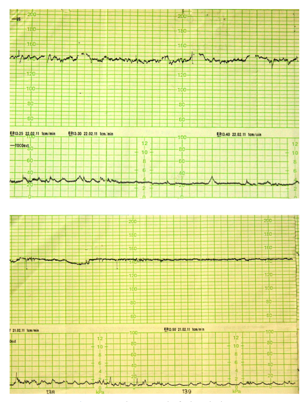
Fig. 2 - Pre- and post-operative fetal monitoring.