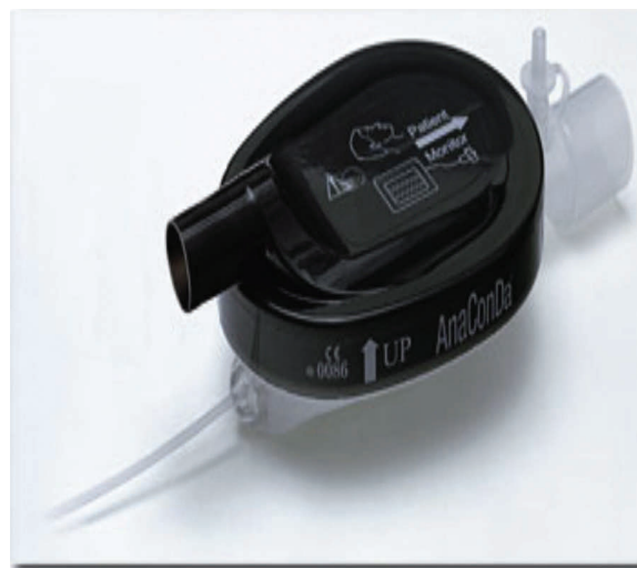
Fig. 1 – AnaConDa® device (AnaConDa® Sedana Medical, Uppsala, Sweden).

The purpose of this paper is to disclose our results following the use of inhalation sedation for a maximum of 72 h with sevoflórano, using the ACD device in intubated critically ill patients, in our ICU, with a RASS 6 objective of 0–2. And further, to evaluate the effect on renal and liver function in these patients.