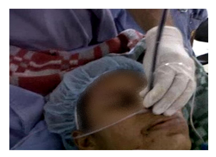
Fig. 6 – Introduction of the fibrobronchoscope through the right nostril.