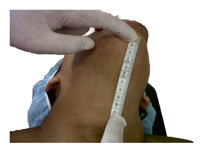
Fig. 2 – Scar by involuted hemangioma – distance tiromentoniana (11 cm).

neck zone II 2 cm right of the midline due to mildly involved hemangioma. A fleshy purple mass with diffuse ulcerated areas is found in the tongue and extended all along the visible surface of the tongue, predominantly on the left side (Figs. 3 and 4) and protruding, making modified Mallampati scoring difficult, DTM 11 cm (Fig. 2), DEM 19 cm, cervical perimeter at 33 cm (Fig. 5), no micrognatia, lower lip with eutrophic scar. Cardiac examination showed no murmurs, rubbing or added sounds; pulmonary examination showed good ventilation. Abdominal examination: gravid uterus 12 cm long, intestinal sounds were present; eutrophic limbs, capillary refill greater than 2s, paleness, symmetrical pulses. At the time of admission, the patient provided paraclincal reports: Hematocrit 25.5%, Hemoglobin 8.3 g/dl, Blood type A Rh negative; oropharyngeal contrasted angioresonance results: global volume increase caused by enlarged arterial, capillary and venous structures due to a hemangioma in the left half of the tongue.