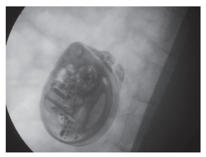
Fig. 2 –Leaking in the system at pump connection (oblique view).

a spinal puncture ant the patient receive 50 µg intrathecally of baclofen as a bolus with complete resolution of his symptoms. He was taken that evening to the operating room for an exploration of his pump. Initially the abdominal site was explored, fluid was found around the pump. The system connection was change to 8709SC connector, and pump was repositioning. An increase in dose of baclofen to 550 µg/day. He quickly returned to his baseline level of function, his spasticity improved dramatically. He was discharged home on postoperative day one and on follow-up, he continued to do well.