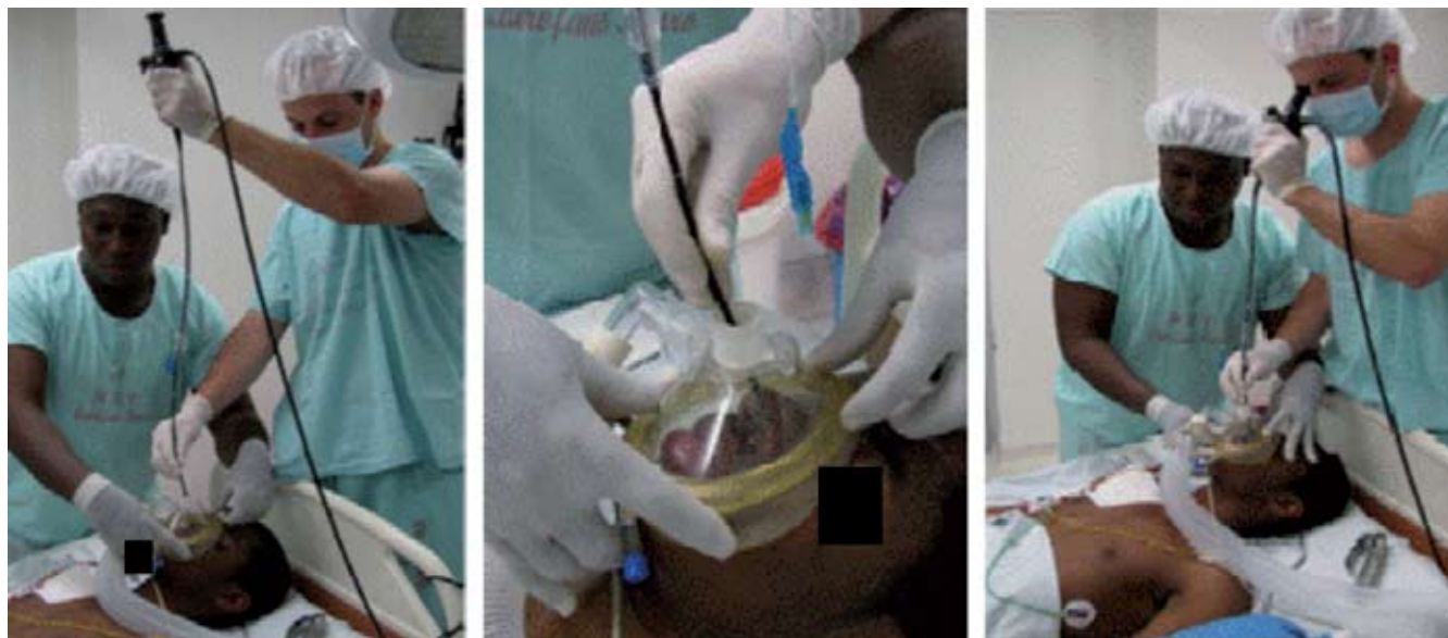
Fig. 7 – Introduction of the fiber optics through the working port.

In the anesthetized and paralyzed patient, the tongue and soft tissues of the pharynx collapse and close the hypopharynx, restricting vision and the handling of the fiberoptic bronchoscope. Patients with a history of snoring, obstructive apnea, obesity, mandibular hypoplasia or nasal obstruction, or those with tonsillar hyperplasia are especially vulnerable to airway collapse during anesthesia. 45 Additionally, apnea time and clinical control of the patient mean that it is