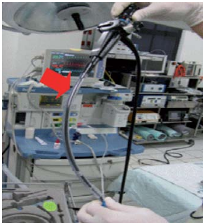
Fig. 6. – Placement of the tube on the fiber optics before the start of the procedure. The tube connector is removed and set aside in a safe place, in order to ease passage through the mask.

It is not recommended to insert the tube in the nostril initially, because of a higher risk of bleeding; it is better to advance the fiberoptic bronchoscope first until the carina is visualized, and then introduce the tube 42 (fig. 7).