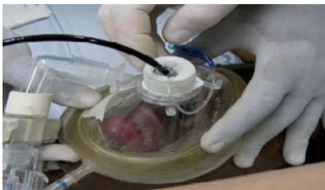
Fig. 8 – Lowering of the tube through the mask.

impossible to carry out this procedure without the help of one or two trained assistants. Maneuvers such as lingual traction or anterior mandibular advancement help clear the airway; alone, they are beneficial, but they are more effective when performed together. 46