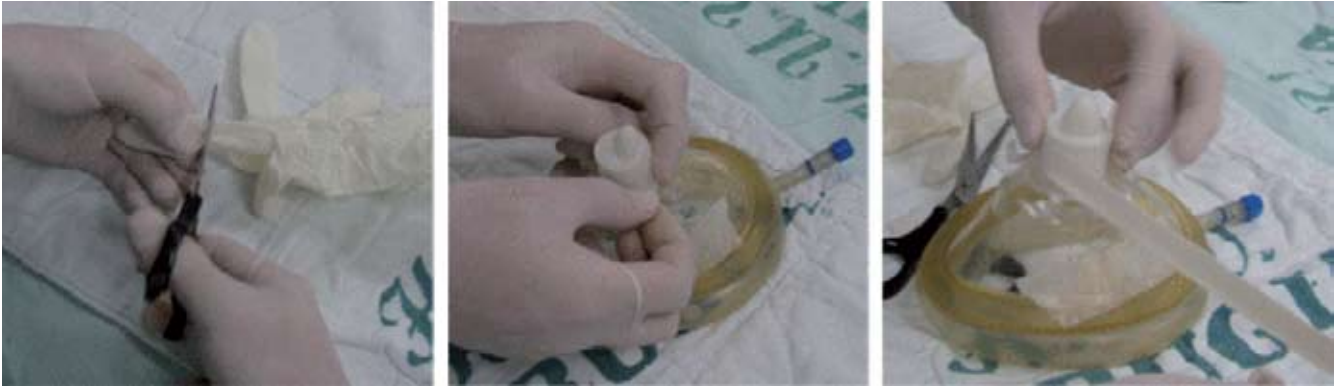
Fig. 3 – Construction of the Lema-Tafur mask. The glove finger acts as a diaphragm to seal the system and allows passage of the fiberoptics and the tube through a small orifice.