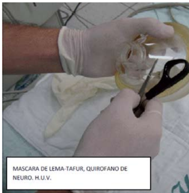
Fig. 2 – Construction of the Lema-Tafur mask. Use of a sharp instrument to perforate a standard face mask. A tracheal tube connector will be introduced through the hole.

lidocaine through the fiberoptic bronchoscope under direct visualization, exactly over the vocal chords.