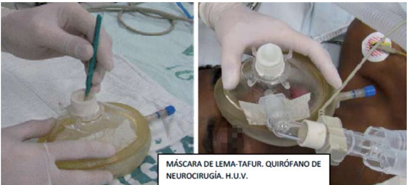
Fig. 4 – Construction of the Lema-Tafur mask. The glove finger acts as a diaphragm to seal the system.