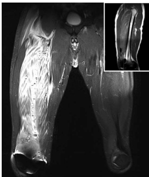
Figure 1. Coronal view MRI STIR T2, increased signal over the VIM. The vastus lateralis and the adductor muscles are not compromised. The blurred image seen on the right knee is due to magnetic interference. MRI = magnetic resonance imaging, VIM = vastus intermedius muscle.