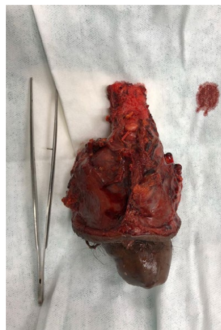
FIGURE 4. Surgical specimen of penile cancer arising from the balanopreputial sulcus and infiltrating the fascia, tunica albuginea and tunica dartos, corpora cavernosa and periurethral spongy tissue.