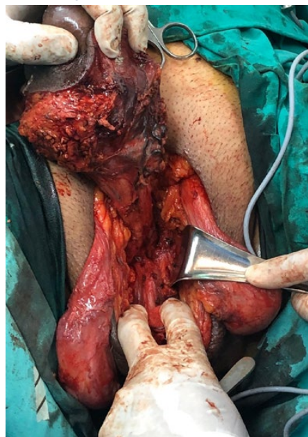
FIGURE 2. Radical penectomy, with sectioning of the corpora cavernosa.

With the patient placed in modified lithotomy position, radical penectomy