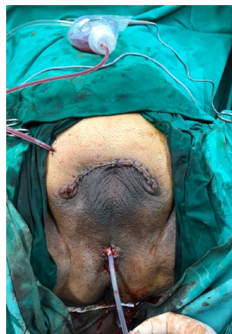
FIGURE 3. Surgical wound after radical penectomy with perineal urethrostomy and Jackson Pratt surgical drain.

The patient received tranexamic acid, ephedrine 6 mg, magnesium sulphate 1.25 g and paracetamol 1 g, plus antibiotic therapy according to schedule. Two units of red blood cells were transfused due to blood loss of approximately 700 cm 3 . Surgical time was 115 minutes. The patient was transferred to the step-down unit for postoperative recovery, with the following vital signs on arrival: BP 114/74, HR 67 and 98% ambient Sato 2 , no fever and a score of 0 on the Visual Analogue Scale (VAS). The patient had a stable course over the next few days, with static and dynamic VAS pain scores of 1 and 2 (average during the first 96 hours), respectively, treated with peridural patient controlled analgesia (PCA) consisting of 0.125% levobupivacaine initially set at 5 (mL/h infusion), 5 (mL bolus as required by the patient) and 20 (20 minute block). Additionally, paracetamol, pregabalin and citalopram were also used. The VAS and peridural infusion data are shown in Figure 5. Because of high daily requirements (average demand of 35