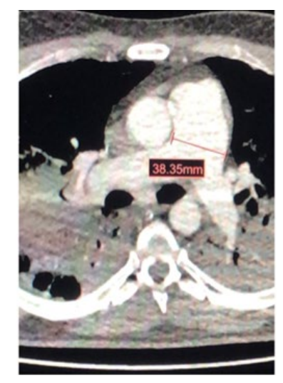
Central filling defects in both main pulmonary arteries, and presence of thrombi. Radiological signs suggestive of hemodynamic consequences in the right heart chambers: pulmonary artery caliper up to 38mm, rectification of the intraventricular septum.

lateral wall or the RV (basal and middle segments) compatible with McConnell sign. Intraventricular image compatible with a 2x3,5 cm thrombus near the moderator band of the right ventricle. No thrombi were found in the pulmonary artery or its branches, and there was no significant valve dysfunction or pericardial effusion. Evidence of partial collapse and dilated inferior vena cava.